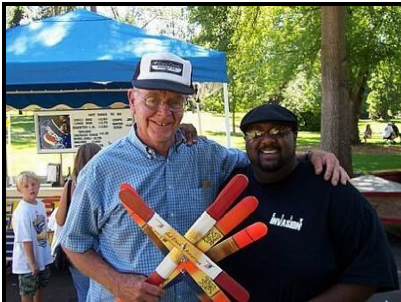
This man had been an OA preacher in Mexico.