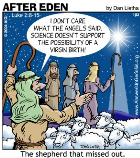
The shepherd that missed out.