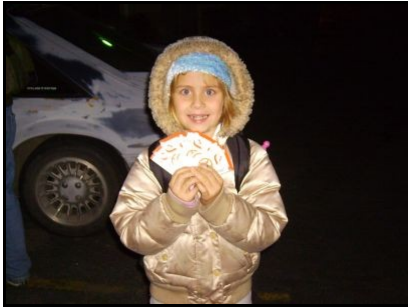
An eight-year-old seed sower.