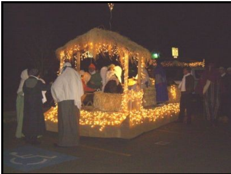
At least our small city will still include the nativity in its Christmas parade.