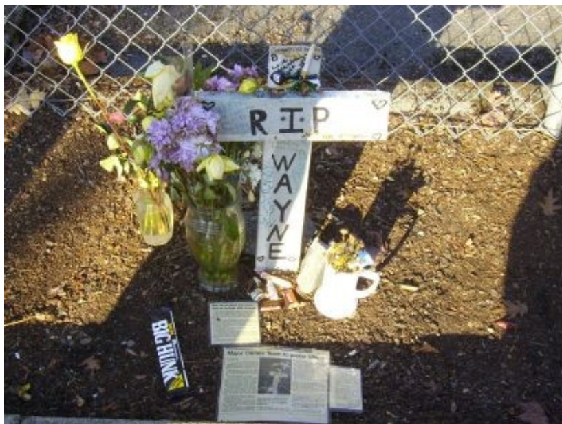
A young man was killed in the walkway beside the post office where we regularly witness.