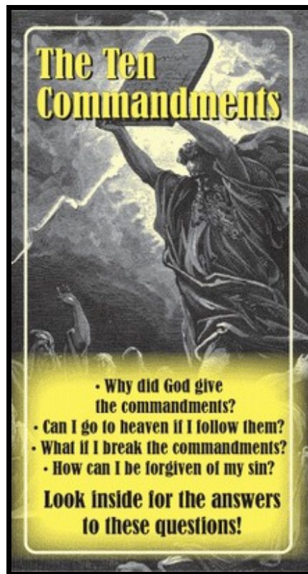
This was one of the tracts we found. Click here to read it online.