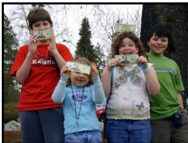
These kids loved the Million Dollar Bill tracts.