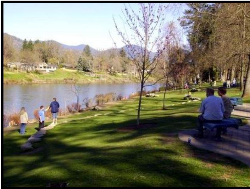
A glimpse of some of the people gathered along the river.

I whispered another prayer for God's strength. When I opened my eyes I saw the red-headed woman get up. She went over to throw her paper in a trash can and then walked away. My heart sank and I felt I'd just missed an opportunity God had provided. However, I climbed up on the bench anyway and opened my mouth. There were three or four dozen people within the sound of my voice. I didn't draw a crowd or offer trivia questions to get their attention, I just introduced myself and went into the gospel. I preached for ten and a half minutes. About half-way into it, I turned and saw that a little ways off to my right the red-headed woman had stopped at her truck and was standing there just inside its open door listening to me. She stayed and listened the whole time! Then once I was done, she left.