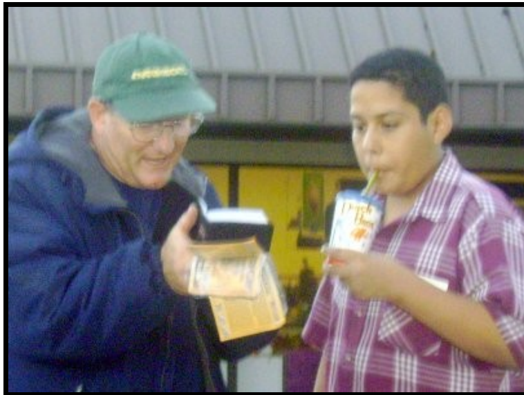
Digging into the Word downtown.