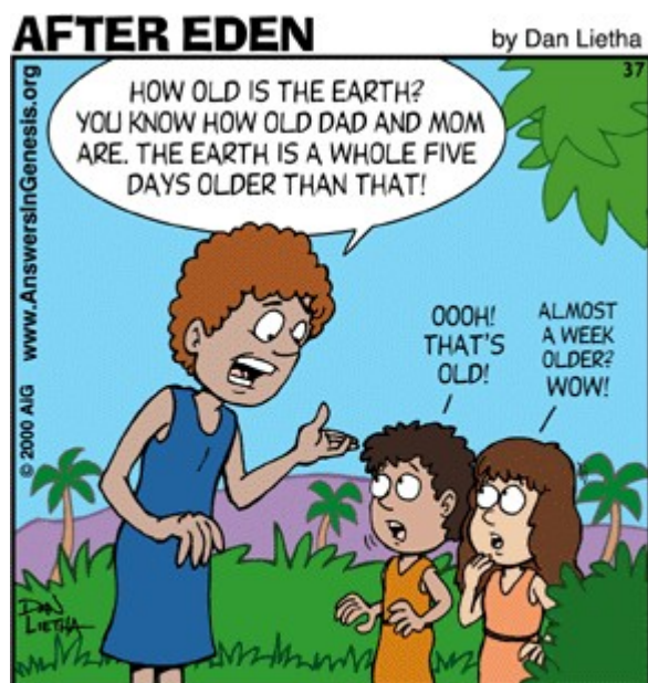
Adam and Eve's kids talk about the age of the earth.

"As a child I received instruction both in the Bible and in the Talmud. I am a Jew, but I am enthralled by the luminous figure of the Nazarene. No one can read the Gospels without feeling the actual presence of Jesus. His personality pulsates in every word. No myth is filled with such life." (Albert Einstein)