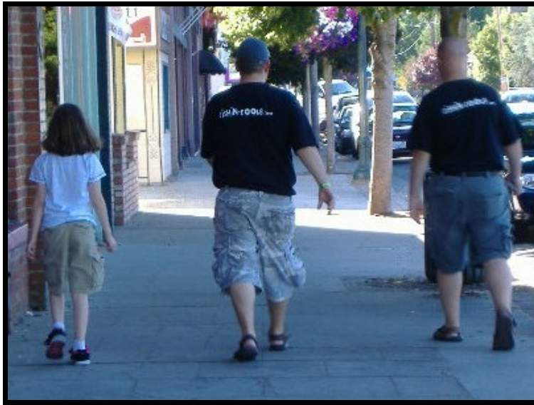
Cargo shorts (for sheer pocket size) seem to have become the standard team wear.