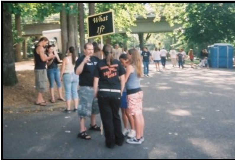
We had the "What If?" sign at Boatnik last year.

At this point I want to break from my usual "fishing" report format and switch to something more of an alert.