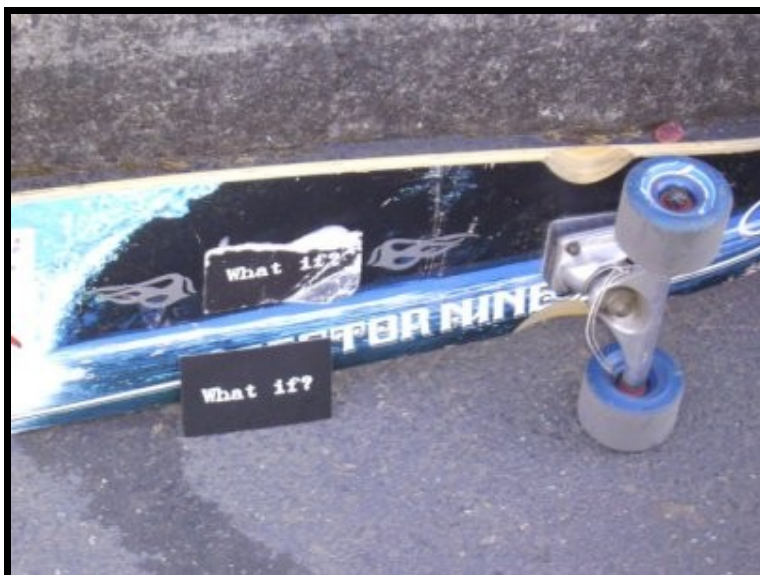
One of the kids that hangs out downtown put a tract on her skateboard.

passing out What If? tracts it must have looked like we had something to do with the event. People readily took the tracts and often even said "thank-you". Rarely have tracts gone out so easily. We went through 250-300 that afternoon.