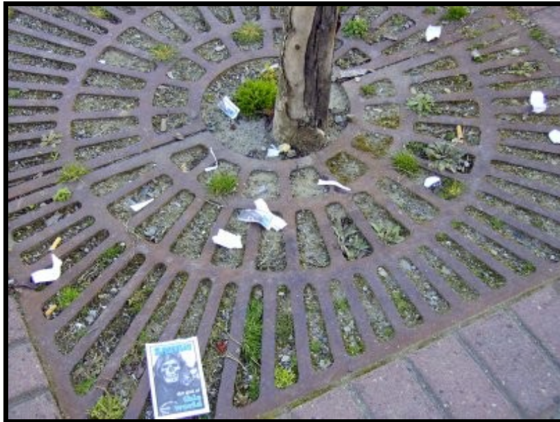
Someone shredded one of the tracts. A sign of conviction?

Our team of three was out again on Saturday. We're starting to see some warmer spring weather so the foot traffic and the number of people at Riverside Park is steadily increasing. We made a couple of passes along our usual stretch of 6th Street and a loop through the park where we gave out a good number of gospel tracts. We didn't pick up any one-2-ones but we still had an encouraging encounter at the park. A minivan slowed as it passed us and a young woman rolled down the window. She held up the Ticket to Heaven tract I'd given her. She said "This is wonderful. Good work guys!" God is good. Often times we face either opposition or indifference when we're laboring in the field, but he is faithful and puts encouragement like this across our paths to give us that second wind and enable us to keep going.